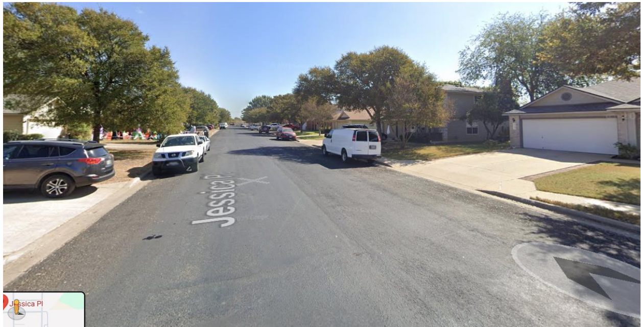
View of Jessica Place East (residential 20 mph)