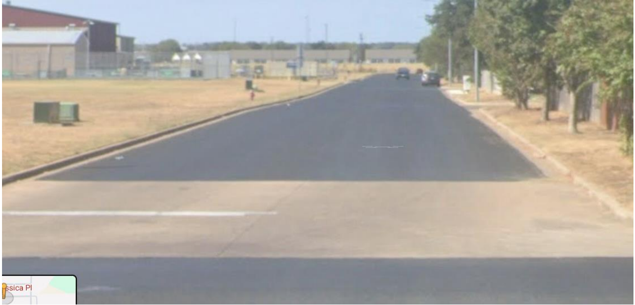
View of Jessica Place West (arterial Throughway)