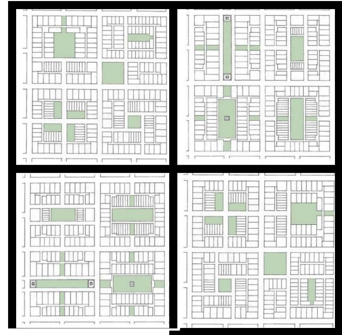
Block Examples for illustrative purposes

Building Types - Building Types correspond to the Place Types and Street Types. Building Types are contained within each Place Type to confirm the intensity of development aligns with the infrastructure and building forms to support the wide variety of Building Types.