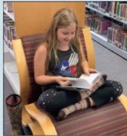
Enjoying a book