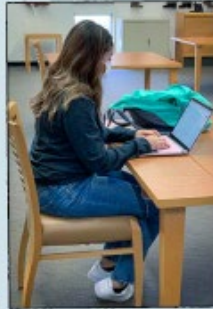
Utilizing the wifi