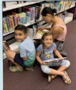
Picking out books